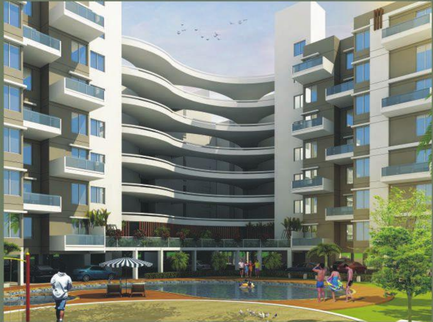
Royale Vision, Ravet

At Royale Vision, a healthy lifestyle is an everyday reality that you will truly cherish.